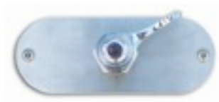
The new ADA compliant self shutoff valve from WESCO.

WESCO Fountains, Inc., headquartered in North Venice, Florida, is a leader in the water feature industry delivering innovative products and solutions for their clients where customer service is the paramount goal.