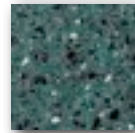
New solid surface material and "granite" designer colors, from top: Beige, Blue & Green.